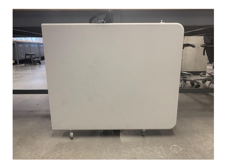
Figure 8: Folding table in a folded position. Wheels are opposite to the handles.