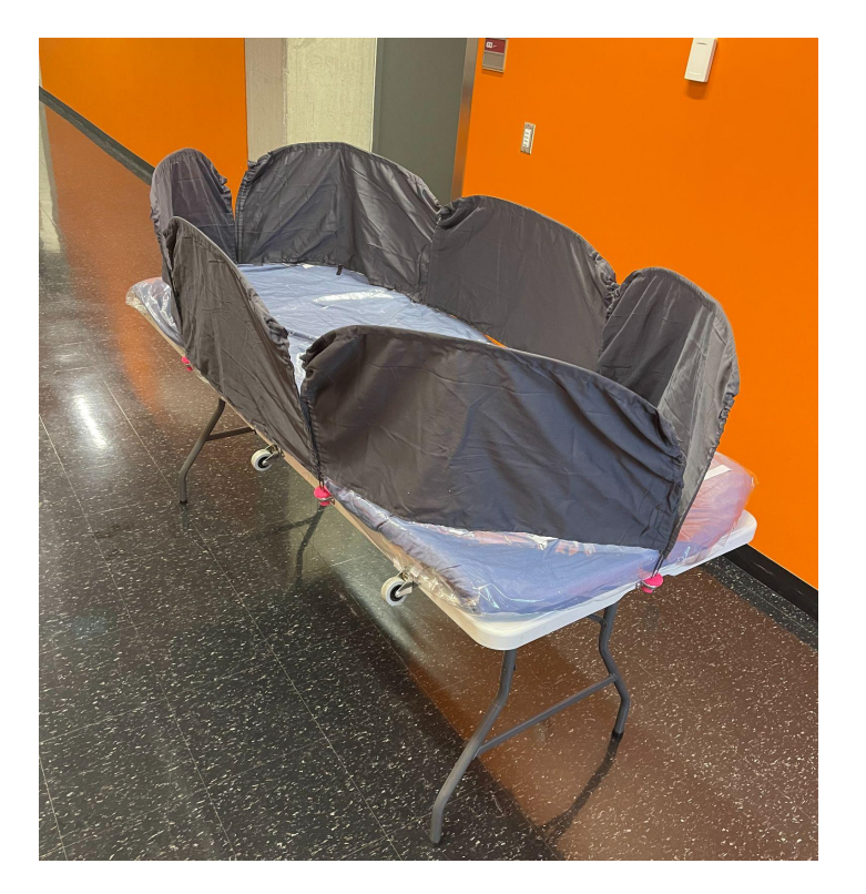
Figure 1: Final Prototype of the Change N Go

The demand for a portable change table has not yet been met with an adequate solution that is portable, lightweight and comes with privacy features. Current 'portable' change tables available on the market simply do not meet basic expectations. For example, current options are either too bulky, non-portable, overpriced, or simply do not come with privacy features. This is crucial since these are the basic fundamental needs of the average user. What makes the Change N Go stand out from the other options is the inclusion of the basic needs all into one portable table, as a product like this does not currently exist with the same price tag.