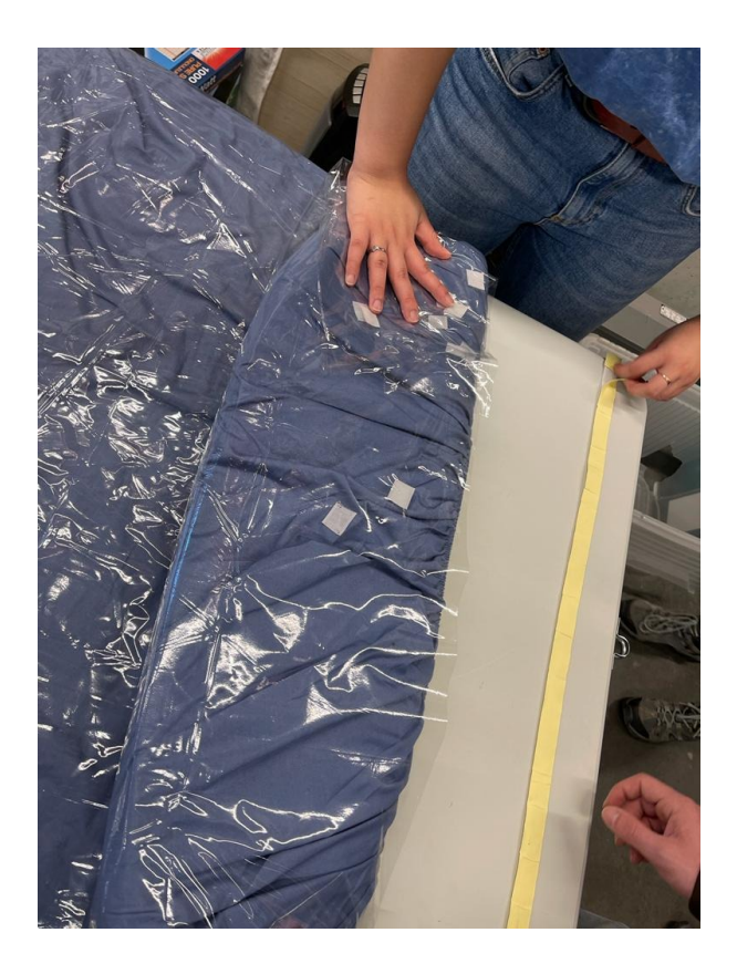
Figure 4: Change and Go Mattress