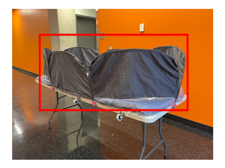
Figure 5: Change and Go Privacy shades