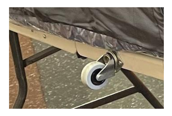
Figure 11: Wheel Castors mounted to the edge of the table.

To make the table more portable, we installed wheel castors on one of the edges of the table. This table edge is opposite of the handle as such it allows the table to be transported like a suitcase. We secured the wheels using screws and nuts that traveled through both the metal frame and the plastic edge. The castors were mounted diagonally so that the screw holes on either corner are parallel to each other in order to fit the table edge (See Figure $$). As such the edge protruding to the bottom of the table edge had to be bent outwards using pliers to ensure it would not affect the table through its folding assembly process. We also installed metal pipe holders along the edges in similar fashion. These pipe holders are about an inch and a half in diameter. These were the smallest pipe holders we can find commercially. They serve as the holders for the privacy shades we made. We used six holders for six privacy shades. They were placed about 30 inches apart on