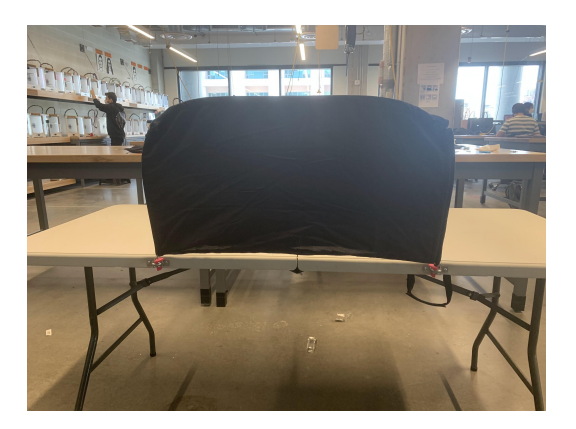
Figure 12: Privacy Shade

the edge of the table. We adapted our design so that a full shade would cover the middle of the table. This helps better ensure the privacy of the user but also avoids installing the holder over the middle of the table where the fold would be.