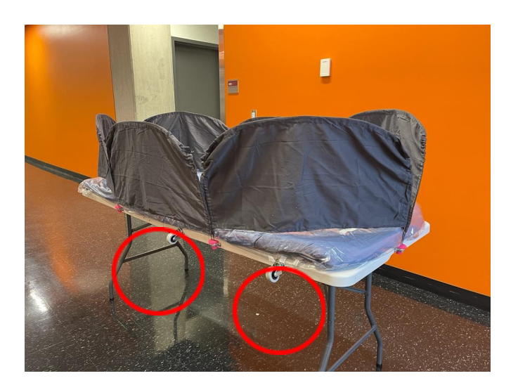
Figure 6: Change and Go Wheels

To facilitate the use of the change table, 2 wheels have been added. When the table is folded the user can easily transport the table by rolling it.