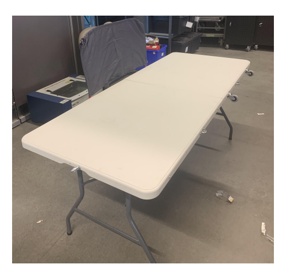
Figure 9: Folding table set up, pipe holders and wheel castors are installed. One privacy shade can be seen.

The table we chose to buy is a For Living Folding Table from Canadian Tire. We chose this product because it fits within the target specifications we had decided on. It was easy to assemble, relatively lightweight (around 12kg) and the dimensions are within acceptable tolerances both assembled and folded. We tested these specifications with a similar table available to use provided by CEED. Our team sat on the table and ensured it could support the load required for the assembly. After realizing the specifications were met, we made the purchase. Most