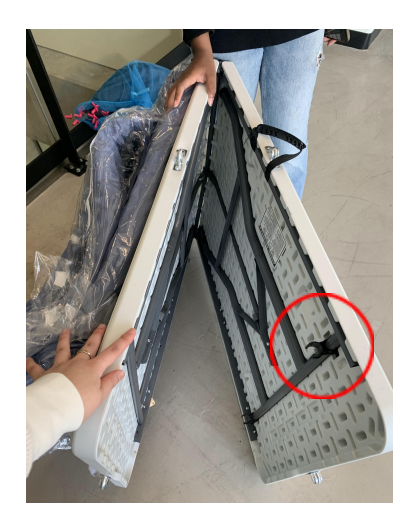
Figure 3: Unfolding the table. The plastic holder mentioned in step 1 is circled in red.

1. Unfold the table by detaching the table legs from the two plastic holders.