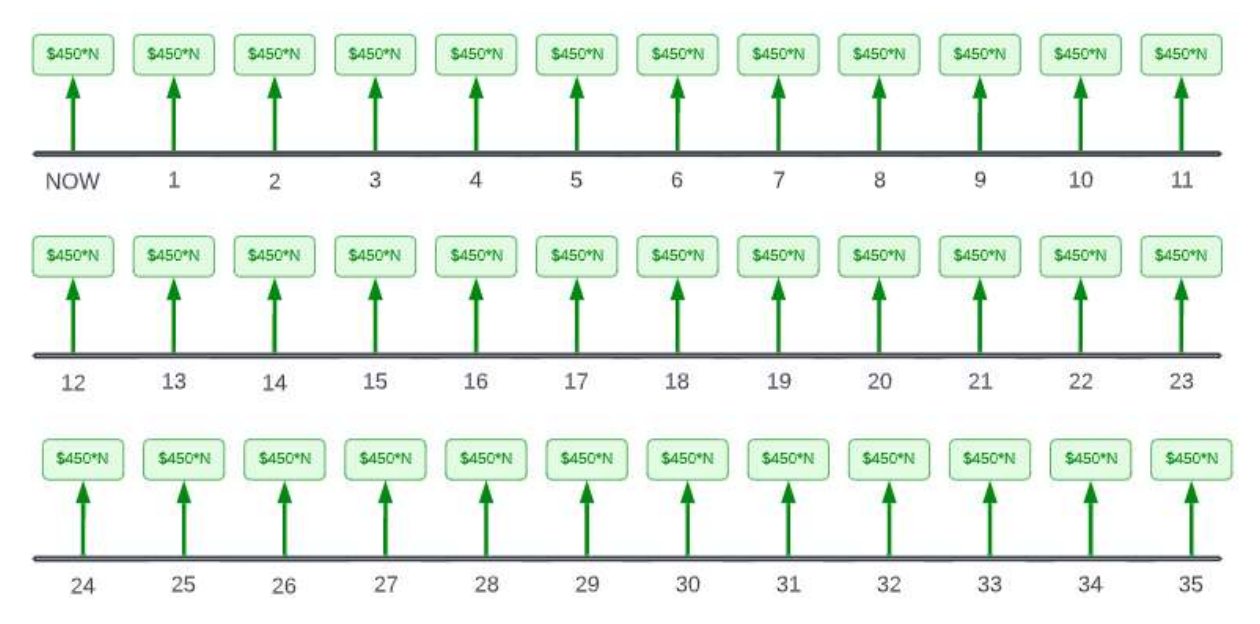
Figure 3: Income NPV