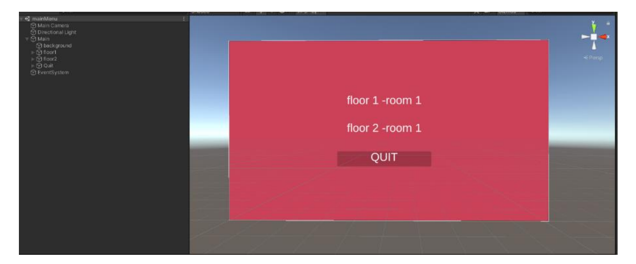
Figure 1: Main Screen

Based on beneficial feedback of our clients, the pre-determined target specifications, and criteria, we have produced our first prototype below. In this model, we believe we have validated our assumptions and have efficiently presented an encapsulation of the needed design criteria.