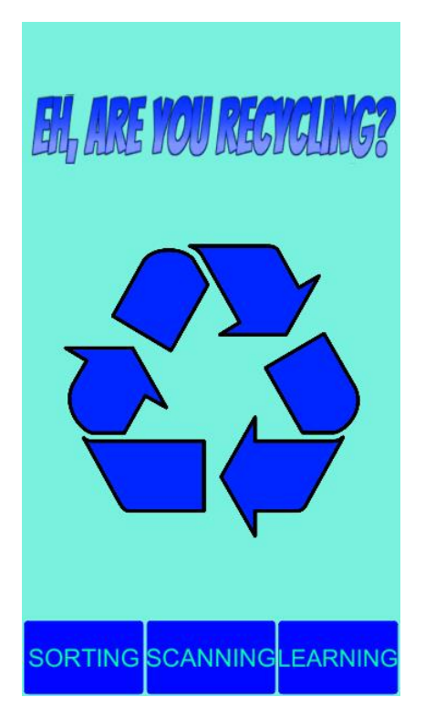
Figure 1: Home Page of App