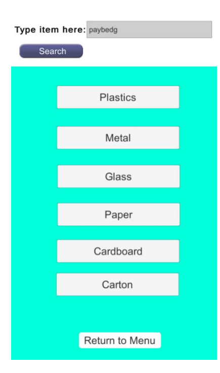
Figure 3: Gibberish in Search Bar

The manual sorting pages were updated with new visuals and every section within the sorting menu was completed with images along with coloured text to help users determine which bins