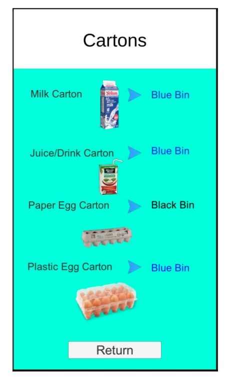
Figure 4: Manual Sorting Page - Carton

certain items go into (figure 4). Every button was tested to ensure that the user can return to the sorting menu after arriving at a page.