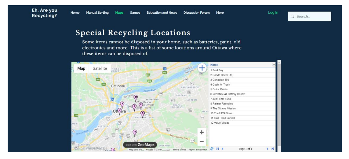
Figure 6: Special Recyclables Locations Map

The change of the initial special recycling locations map was made to maintain consistency between the maps and the addition of the waste bin map was made because the client showed an interest in the concept. It is isolated to the campus because Mr. Bouchard is an alumnus of the university and is enthusiastic about increasing recycling on campus and this will encourage student use of the website and app. The University of Ottawa campus was chosen as a trial location, but in the future the map will be expanded to include other parts of the city and even other cities within Ontario and Canada.