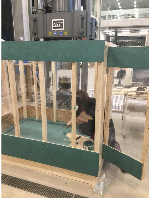
Figure 8. Door

Materials: Two 3"x2"x5' Two 3"x2"x2' Two 8"x2' OSB