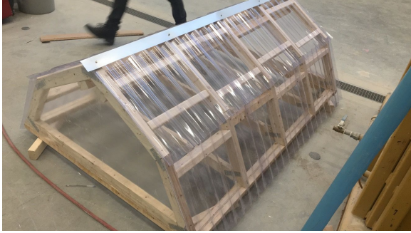
Figure 10. Roof

Materials: Five 2"x4"x2' Ten 2"x4"x13" Ten 2"x4"x21" Twenty 2"x4"x18" Fifty Aluminum Gusset Plates Two 13"x6' Corrugated Plastic Two 21"x6' Corrugated Plastic Two Polyethylene Plastic sheets cut to size