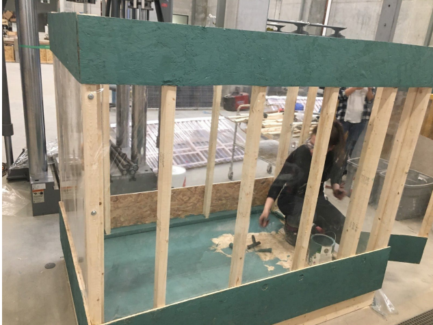
Figure 7. Walls